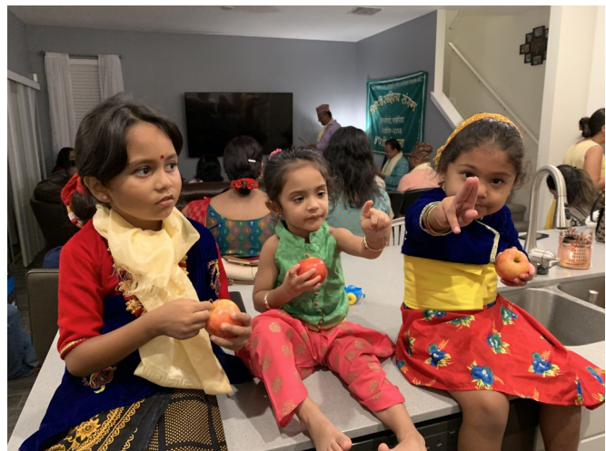
Deusi Bhailo Program Organized in Orlando- 10-27-2019