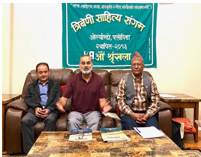
Nepalese community in Orlando , Organized 41st “Tribeni” Series at Devkota Niwas on Dec.9,2019