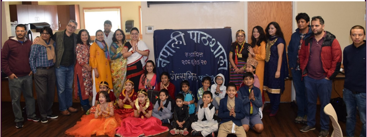
Opening Ceremony of Nepali Pathshala "Gainesville"