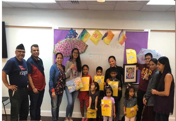
INLS Florida chapter completes almost 10 years of organizing INLS-Florida chapter West Palm Beach Pathasha- la in Palm Springs library on a monthly basis. Nov.9, 2019

Even though Nepal may not seem like a large country, it has an abundance of culture, beauty, and love. Nepal is one of the most beautiful places on Earth with all the different landscapes and cultures everywhere.