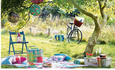
Nepali Community Picnic Date: April 11, 2020, Saturday Hosted By: Jacksonville Chapter

We are on the web www.floridanepalese.org